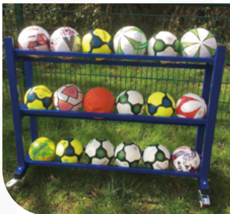
FOOTBALLS & STORAGE