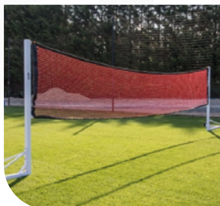
SOCCER TENNIS NETS